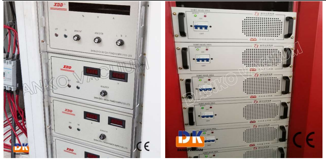
AFTER-SALES SERVICE & SUPPORTING:

Danko Vacuum Systems and our global service partners can provide onsite installation, repair service, preventative maintenance, applications and service training. We are available to provide support for your system 24/7.